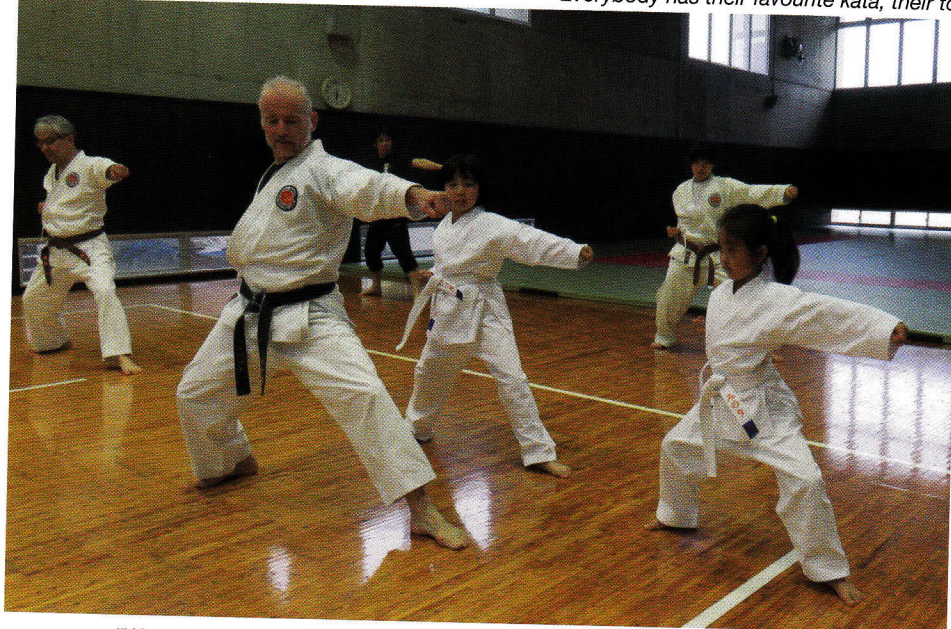
"Working on the Heian Kata over and over again never loses its excitement."

Nowadays the technical level – in classical music as well as in Olympic Karate – has become enormously high. It is all about perfection. Every child prodigy plays a showpiece like Ravel's "Tsigane" technically absolutely flawlessly. But they sound almost eerily the same!