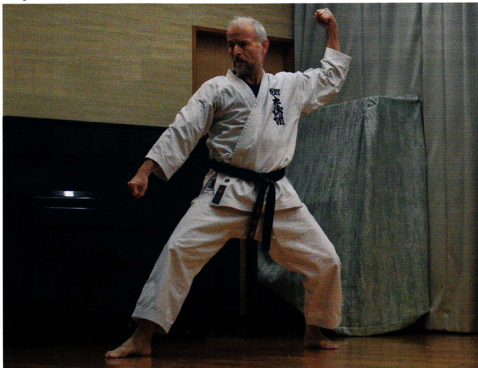
"The kata will – as a phrase in German puts it, – seep into our flesh and blood."

For us Karateka I would like to add: "And perform a little Kata ...!"