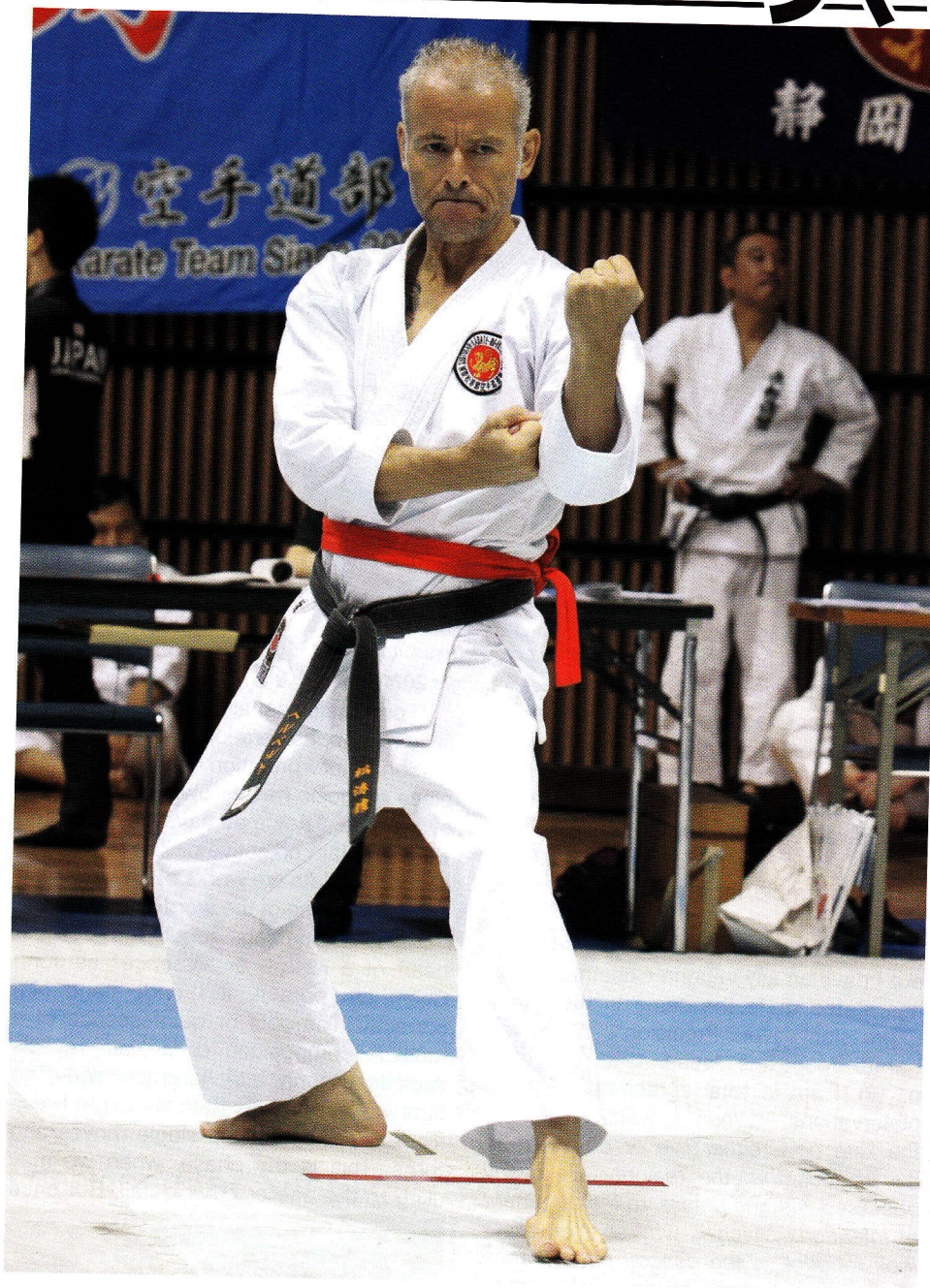
"Everybody has their favourite kata, their tokui, their speciality.".

In a flash I thought: That's it! That is exactly what makes a great and real musician, and a real Karateka too! Never lose the passion for your favourite piece of music or Kata, even after decades of "knowing" it. Having this kind of passion allows you to hone and shine and polish your music or your Kata during your whole lifetime. And it will always be new and fresh, regardless of being the same "old" set pattern. Moreover exercise or training will never be boring. There are always new things to discover, to refine or reform. Indeed, working on e.g. the Heian Kata over and over again never loses its excitement.